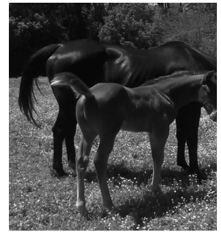
Moonshine Mullin - Campwood colt 4/7/20 Joe Cogburn, breeder