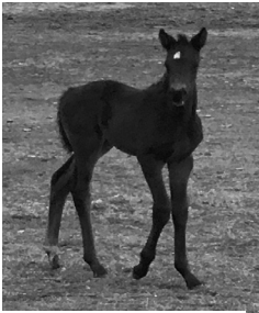
What a difference 2 months makes!!! 4/23/20 Outwork - Heat My Dust filly 2/24/20 Dennis E May, breeder