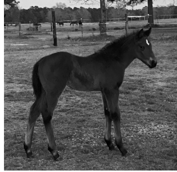
Astern - Bird Harbor filly 2/14/20 McDowell Farm, breeder