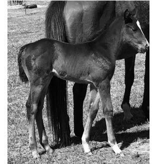
Gentlemen's Bet - Kitty's Dream colt 2/21/20 McDowell Farm, breeder