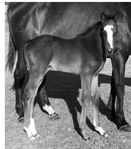
Street Strategy - Safflower filly 3/21/20 Jan Gossage, breeder